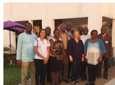
CNESVS of IVORY COAST November 2018, Abidjan, Ivory Coast