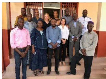
CNERS of GUINEA, Decembre 2018, Conakry, Guinea