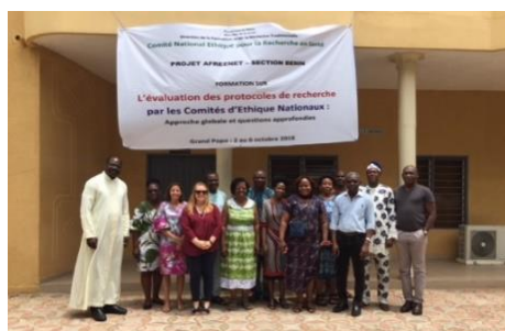
CNERS of BENIN September 2018, Grand-Popo, Bénin

These training sessions were also a unique opportunity to address the community engagement' issue, and the specificities related to the information and consent of the population in each country, from the point of view of the Ethics Committees. It was also the opportunity to discuss several crucial ethical issues in relation to the development of genomic studies and "Big data".